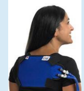
003-22 Universal Pad V797D-50436 SPO200-20-H-0019