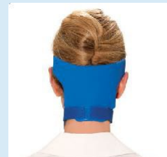
003-11 Occipital (Rear Head) Pad