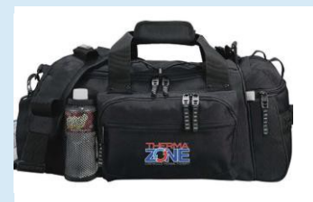
003-05 Carry Case (Holds unit and 4 pads) 003-03 Car Charger