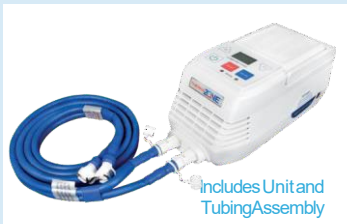
003-99 ThermaZone Therapy System Includes Unit and Tubing Assembly