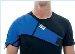
003-15 Shoulder Pad Fits up to a 44" Chest V797D-50436 SPO200-20-H-0019