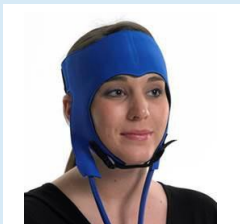
003-10 Front & Side Head Pad