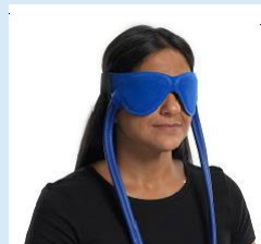
003-12 Eye Pad