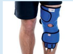
003-17 Knee, Elbow Pad V797D-50436 SPO200-20-H-0019