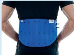
003-18 Back, Abdomen, Hip Pad V797D-50436 SPO200-20-H-0019