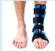
003-19 Ankle Pad V797D-50436 SPO200-20-H-0019