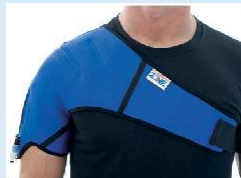
003-20 Large Shoulder Pad Fits up to a 54" Chest V797D-50436 SPO200-20-H-0019